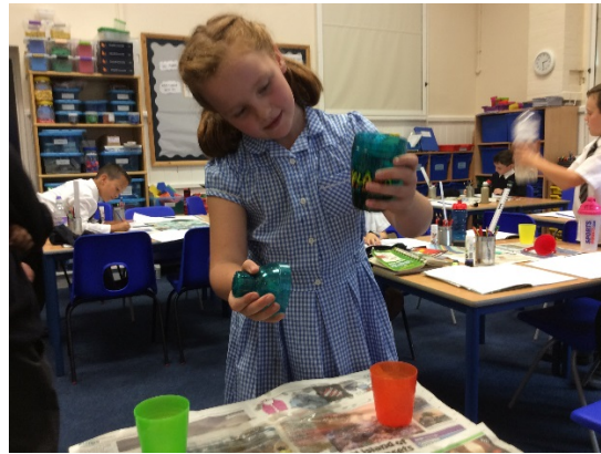
Does gas weigh anything?

In Maths we will be looking at subtraction